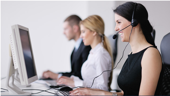
AEM provides excellent customer service with an emphasis on quality support.